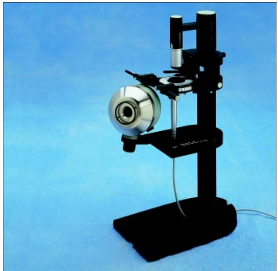
Fig.1 Telephone Test Head Type 4602 B shown with Mouth Simulator Type 4227, in LRGP modal position, and Ear Simulator for Telephonometry Type 4195 (both must be ordered separately)

Telephone Test Head Type 4602 B allows accurate and repeatable positioning and subsequent measurement of a telephone handset in the standardized LRGP, HATS and AEN positions as recommended by the ITU-T, as well as in the REF position (OREM A). It is used as a general test jig with other Brüel & Kjær measurement equipment. Type 4602 B has been updated to accommodate handsets with antennas. An upgrade kit is available for updating earlier Test Heads Type 4602.